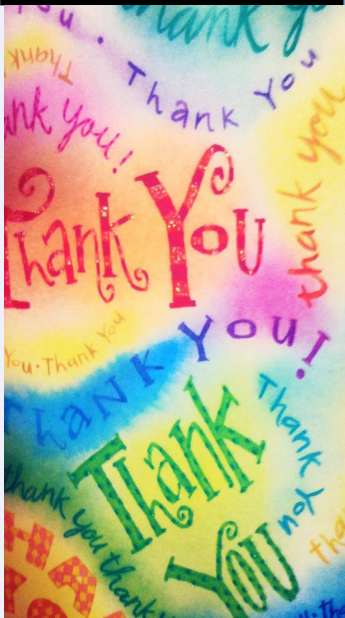
Thank you for your generosity!!

Kindness - being generous, helpful, and caring about others. It also means being selfless, compassionate, and putting others' needs before your own