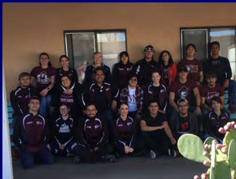
This large group from NMSU Dance Sport were enthusiastic volunteers.