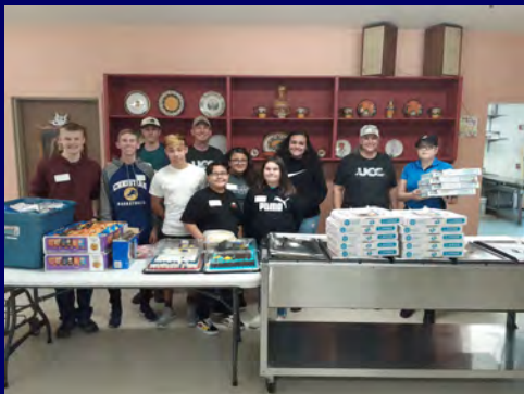
University church of Christ Valentine's Day Lunch