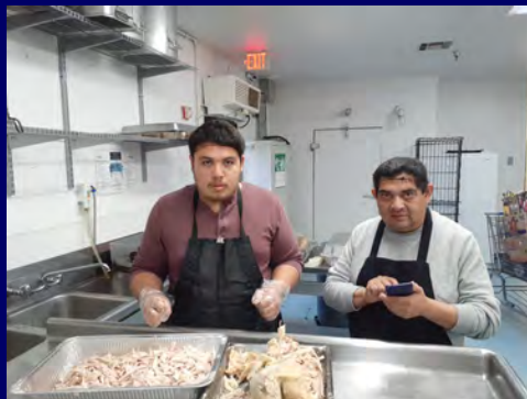
New Church of Christ volunteers helping prepare a meal