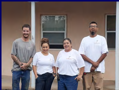
Group from Verizon helping out at the mission