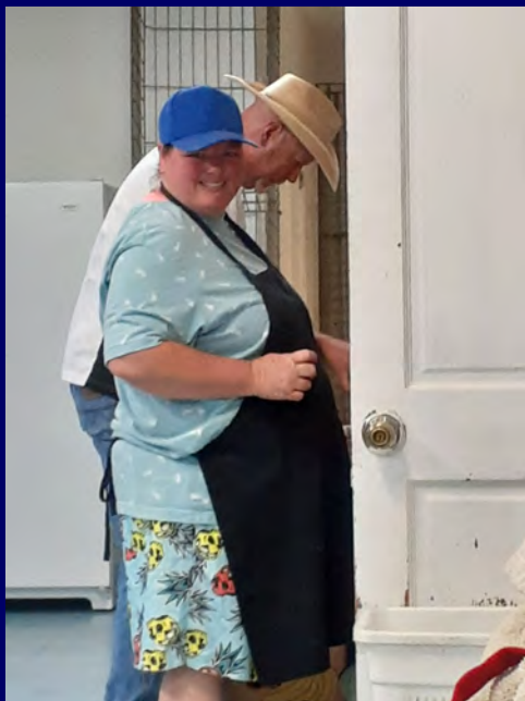
Visiting chef from Ruidoso helping with a meal