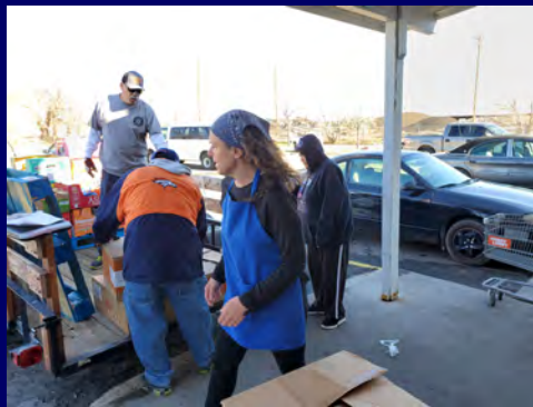
Food comes in every day and our people are ready to unload.